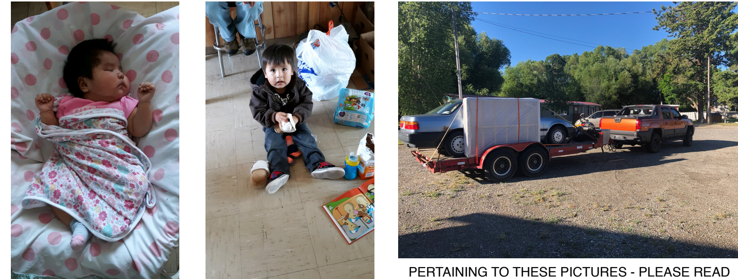
PERTAINING TO THESE PICTURES - PLEASE READ CO-DIRECTOR'S DESK BELOW